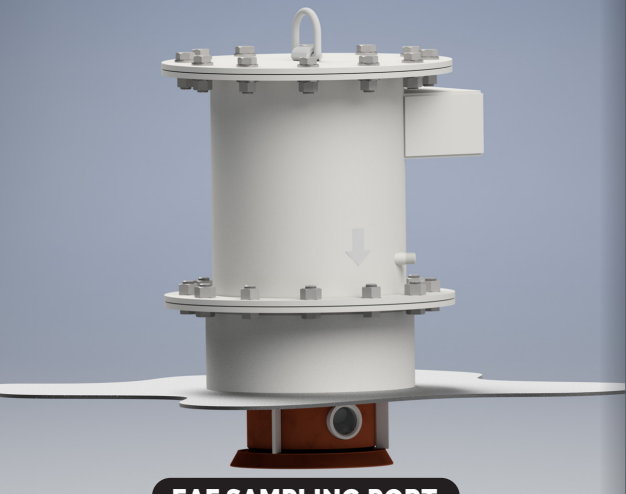
EAF SAMPLING PORT