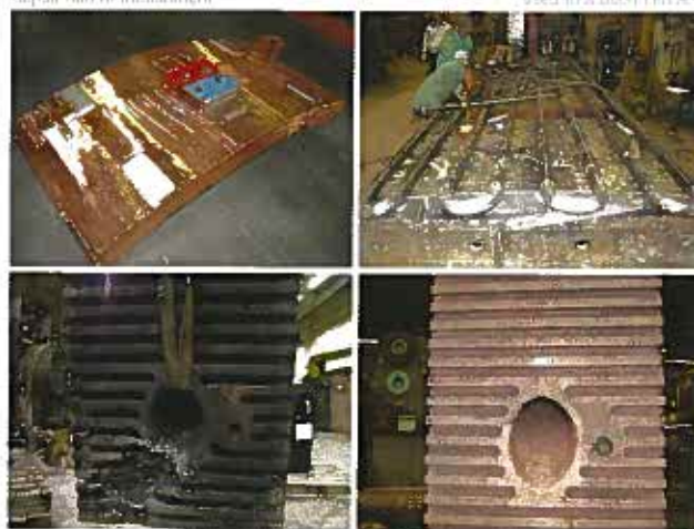
EAF Burner Panel repair - Before and .....After