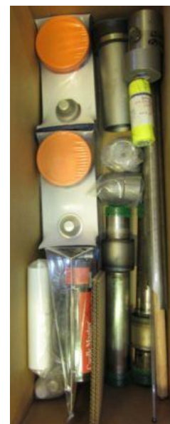
Packaged Repair System