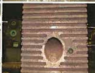
EAFF Burner Panel repair - Before and .....After